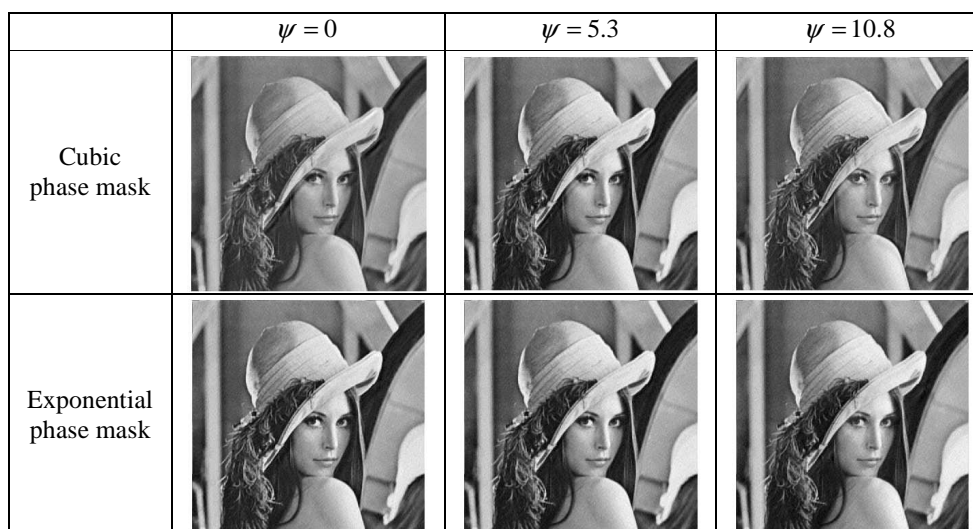
Fig. 3. Images obtained with the cubic and the exponential phase masks at different defocus

Optimal exponential mask parameters are \alpha_{\text{exp}} = 10 and \beta_{\text{exp}} = 1.04 leading to SNR_{\text{mean}} = 18.5\text{dB} . According to the same SNR_{\text{mean}} criterion, a better image quality can be achieved using this exponential phase mask than with the previous cubic one, as shown by the images calculated for several defocus in Fig. 3. It can be noticed that the SNR_{\text{mean}} criterion is correlated with the visual perception: the exponential phase masks introduces less artefacts than the cubic one.